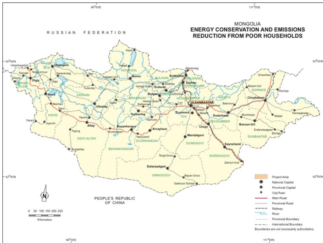
Figure 1: National Map of Mongolia

The host party of the project activity is Mongolia.